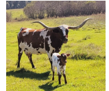
DUNN DEL RIO READY