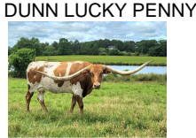
DUNN LUCKY PENNY