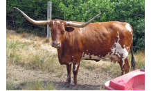
Crown's Royal Darling