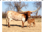
CLR DITCHBANK SADIE