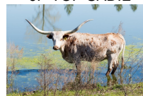
JP TOP SADIE