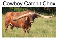
Cowboy Catchit Chex