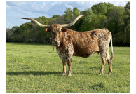
HORSESHOE J LEGIBLE